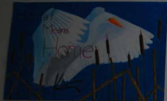
3 rd Place Jaymie Cass 7 th Grade

The great egret looks very elegant and the white water lilies perfectly with the pond of blue water. Because that the great egret is usually when water is shallow and before getting to water. Why should we protect the habitat and resources? The better reason we should protect our water resources. It has been known it they are becoming scarce.